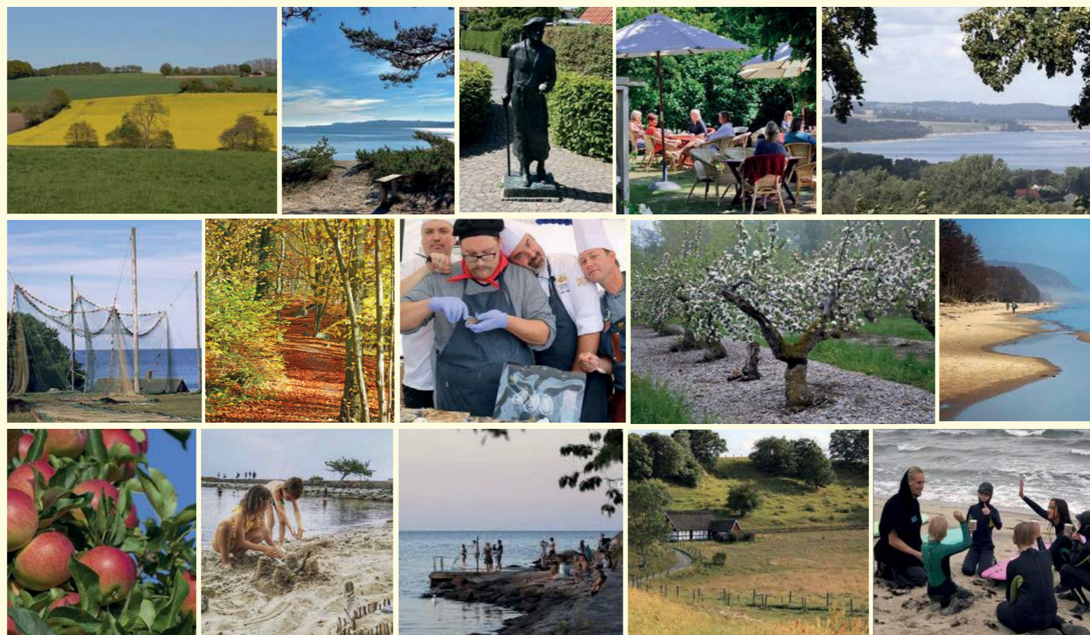
Several of these pictures come from Kiviks Turism's photo competition on Instagram. All pictures are from the beautiful local surroundings at Kivik.